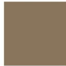
BF350 Desert Tan