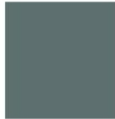
BF650- Smokey Blue

Stamping release powder prevents texturing tools from sticking to the surface of fresh concrete while depositing color to create a marbled or antiqued effect.