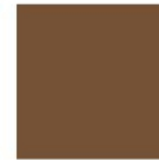
BF1085- Saddle Brown