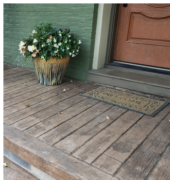
Wood Plank A 5 1/2" wide heavily weathered wood plank in varying lengths. Rustic/ Nutmeg