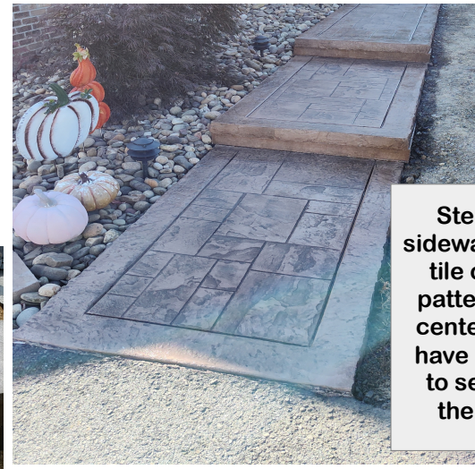
Steps and sidewalks with a tile or stone pattern in the center usually have a border to separate the edges