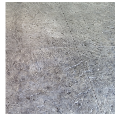
Bluestone A seamless texture with areas of gentle ripples flowing together Midnight Bay/ Medium Gray