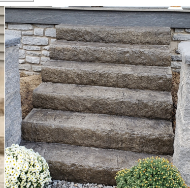
Split Stone faces and stamped treads with flat sides