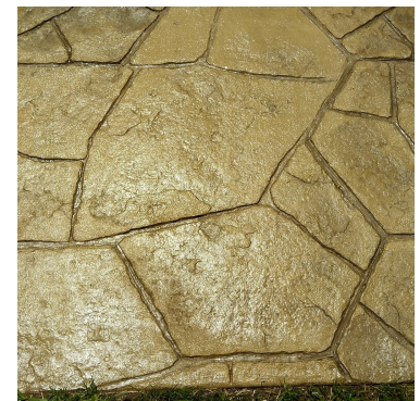
American Flagstone A naturally shaped flagstone pattern with an abundance of variation in stone sizes Desert Sand/ Sandy Buff