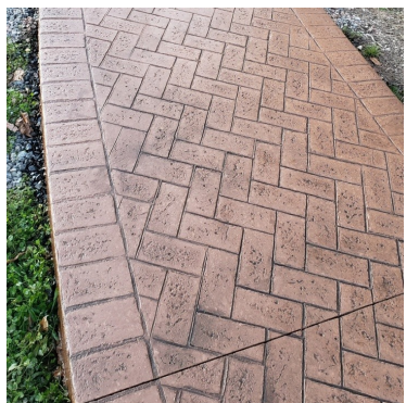
Herringbone Brick A mildly weathered brick texture arranged in a herringbone pattern. Redwood 2 / Medium gray