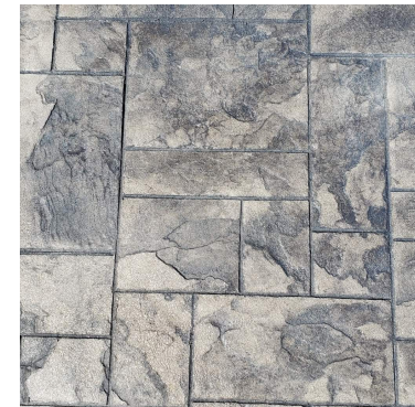
Ashlar Slate A traditional Ashlar Slate pattern with the look of naturally split slate tiles of varying sizes No integral color/ Charcoal

Stamped concrete is concrete that is stamped or textured to resemble slate tile, stone, or brick or any of the numerous patterns available. It involves adding an integral color to the concrete, adding an accent color, called a release powder, as it also keeps the stamps from sticking to the surface, and stamping a pattern into the concrete with polyurethane stamps. The most popular pattern is Ashlar Slate, both for the ability of the pattern to produce a rich two tone color and the straight lines of the tile to conceal the necessary saw cuts better than a random pattern will. There are numerous color choices available, both for the integral color and for the accent color. Stamped concrete is a more durable and less expensive method than using authentic materials such as stone, slate, or brick, but must be sealed with a high quality sealer to enhance the colors and prevent weathering. Unsealed concrete will appear somewhat dull and the colors muted. We use a high gloss solvent based acrylic sealer and generally it will need to be reapplied every 2 to 3 years or whenever it starts to look faded or worn. The following pages provide some ideas of what is available in colors and patterns.