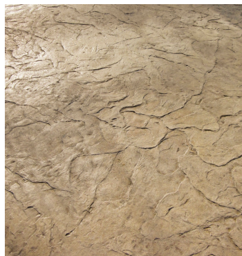
Oxford Slate A seamless slate texture with a more aggressive profile than Bluestone. Santa Fe Tan/ Saddle Brown