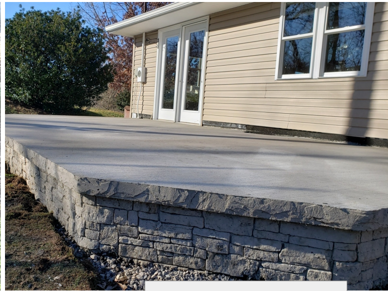
A monolithic slab with a brushed surface, split stone edges, and stacked stone walls