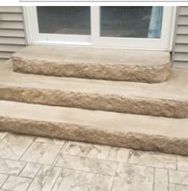
Cascading steps with brushed treads and Split Stone faces