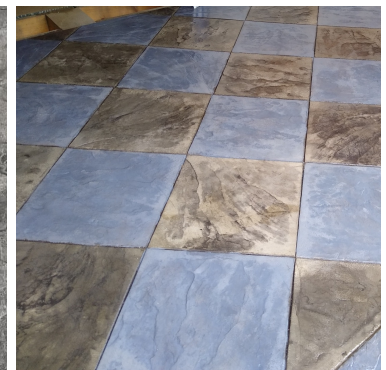
24" Square tile A 24" tile pattern with a mild split slate texture Medium and Dark Gray stain on alternating tiles