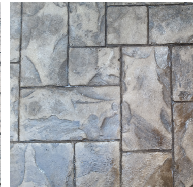
Ashlar Cut Slate A traditional Ashlar Slate pattern with the look of hand chiseled slate tiles of varying sizes Desert Sand/ Nutmeg