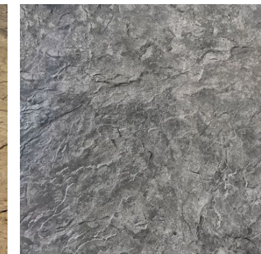
Pennsylvania Slate Slightly less aggressive than Oxford Slate. Taken from a section of Pennsylvania blue slate from Slatington PA Midnight Bay/ Charcoal