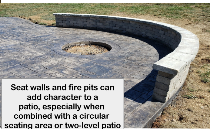
Seat walls and fire pits can add character to a patio, especially when combined with a circular seating area or two-level patio