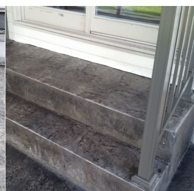
Flat faces and flat sides with stamped treads

Stamped concrete is concrete that is stamped or textured to resemble slate tile, stone, or brick or any of the numerous patterns available. It involves adding an integral color to the concrete, adding an accent color, called a release powder, as it also keeps the stamps from sticking to the surface, and stamping a pattern into the concrete with polyurethane stamps. The most popular pattern is Ashlar Slate, both for the ability of the pattern to produce a rich two tone color and the straight lines of the tile to conceal the necessary saw cuts better than a random pattern will. There are numerous color choices available, both for the integral color and for the accent color. Stamped concrete is a more durable and less expensive method than using authentic materials such as stone, slate, or brick, but must be sealed with a high quality sealer to enhance the colors and prevent weathering. Unsealed concrete will appear somewhat dull and the colors muted. We use a high gloss solvent based acrylic sealer and generally it will need to be reapplied every 2 to 3 years or whenever it starts to look faded or worn. The following pages provide some ideas of what is available in colors and patterns.