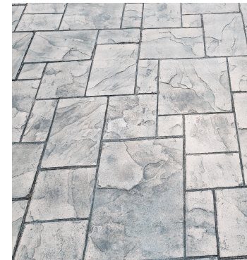
Imperial Ashlar The same traditional Ashlar Slate pattern with much larger tile sizes. Desert Sand/ Smokey Blue