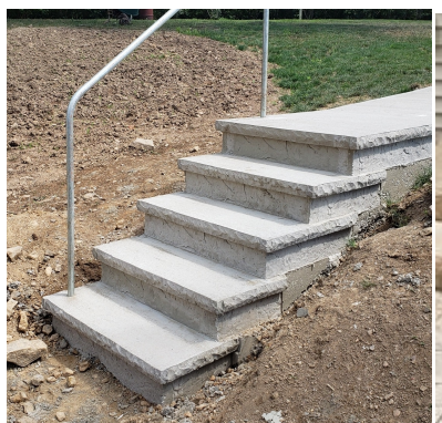
Cantilever style steps in plain concrete with brushed treads