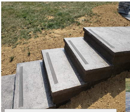
Cantilever style steps with traction strip inserts. These are an important consideration when there is no plan to install a handrail