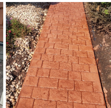
Mayan Cobblestone This pattern is well suited to sidewalks. Slightly more aggressive than brick but still has a consistent surface profile without raised edges Sedona/ Quarry Red